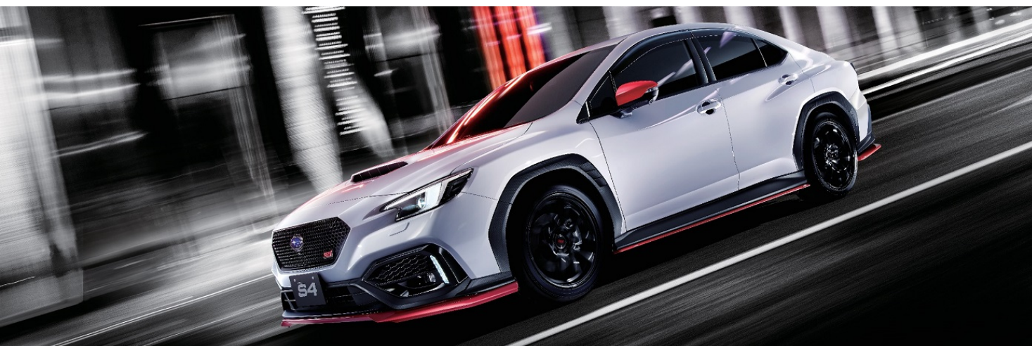
WRX S4 (VB)