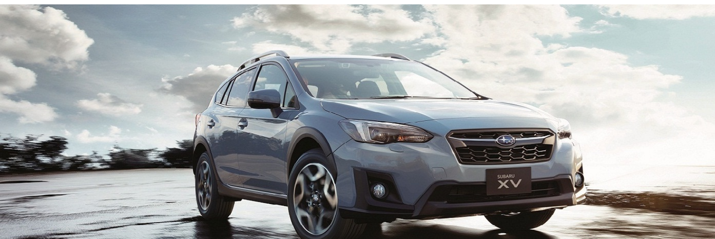
SUBARU XV (GT)