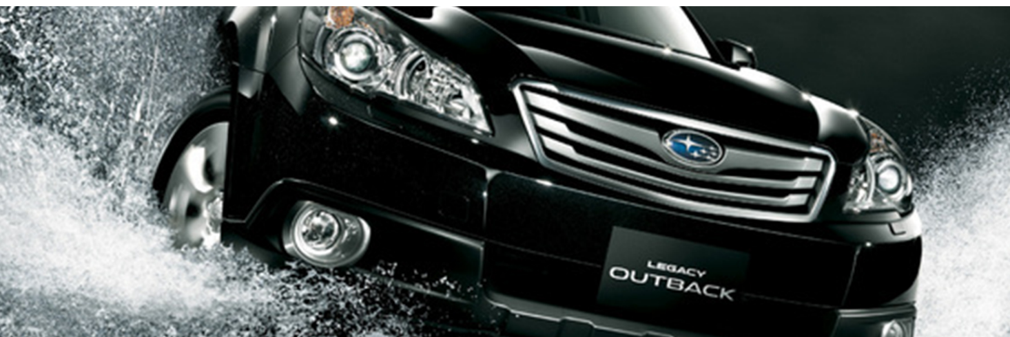
LEGACY OUTBACK (BR)