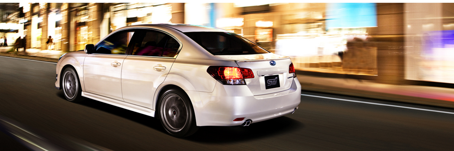
LEGACY B4 (BN)