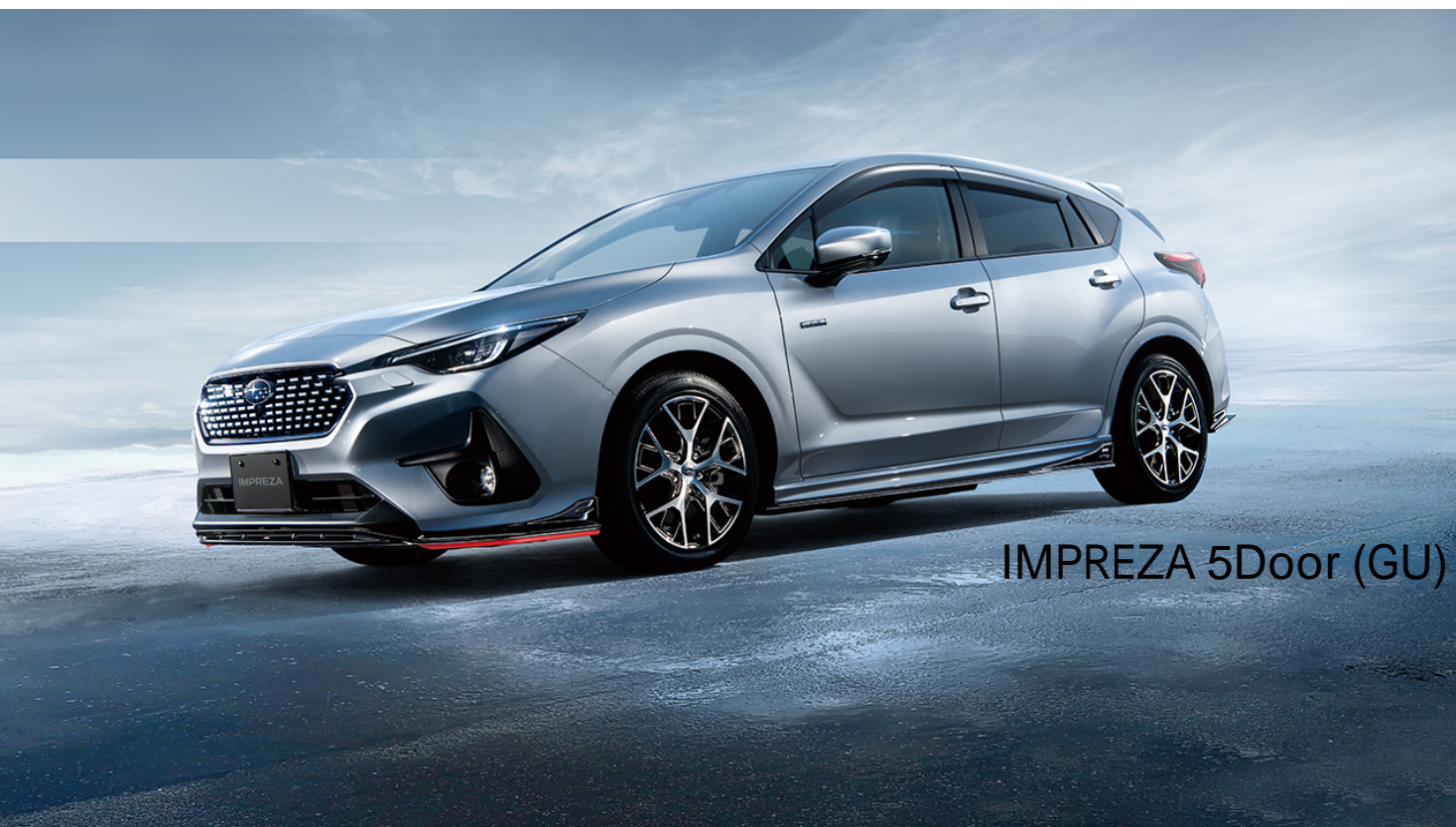
IMPREZA 5Door (GU)

Please consult with your local SUBARU dealership or an authorized SUBARU distributor to confirm the availability, price and installation. Colors shown may vary due to displays and printing processes.