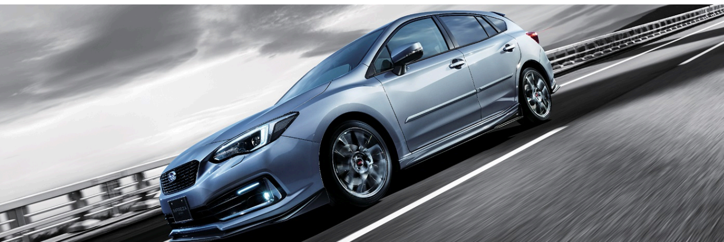
IMPREZA 5Door (GT)