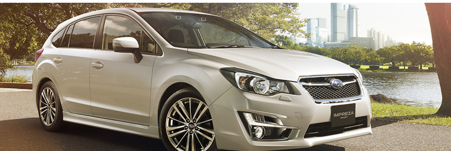
IMPREZA 5Door (GP)

Please consult with your local SUBARU dealership or an authorized SUBARU distributor to confirm the availability, price and installation. Colors shown may vary due to displays and printing processes.