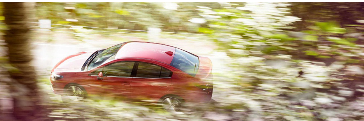
IMPREZA 4Door (GK)