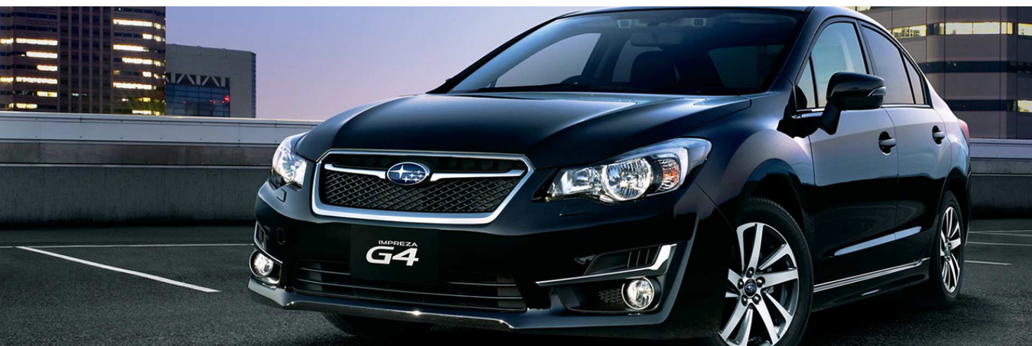
IMPREZA 4Door (GJ)