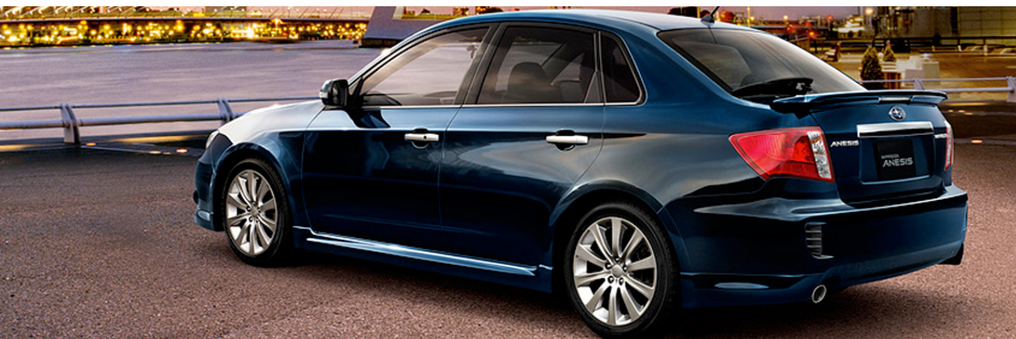
IMPREZA 4Door (GE)